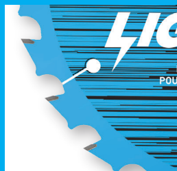
TEMPERED ANTI FRICTION FINISH