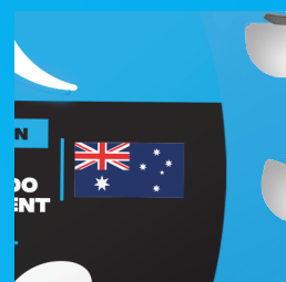
MADE IN AUSTRALIA