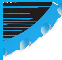
2X FASTER & CLEANER CUTS