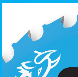
OXLOK ® TOOTH EMBEDDED M9 CARBIDE TIP

BUILT WITH THE TRADESMAN IN MIND, THE OX PRO LIGHTNING CIRCULAR SAW BLADE | 24-TOOTH IS MADE IN AUSTRALIA. THIS PRECISION-ENGINEERED SAW BLADE INTEGRATES ADVANCED FEATURES TAILORED TO MEET THE DEMANDS OF PROFESSIONALS. ITS OXLOK ® TOOTH EMBEDDED CARBIDE TIP ENSURES EXCEPTIONAL CUTTING PERFORMANCE AND LONGEVITY, ALLOWING IT TO WITHSTAND RIGOROUS USE ACROSS VARIOUS CUTTING APPLICATIONS. THE SAW BLADE UNDERGOES A TEMPERED SURFACE TREATMENT AND ANTI-FRICTION FINISH, ENHANCING ITS DURABILITY AND MINIMIZING FRICTION DURING OPERATION FOR SMOOTHER CUTTING EXPERIENCES. WITH A DURABLE CARBIDE GRADE OFFERING ULTIMATE SHOCK RESISTANCE, MARKED AS M9, THIS CIRCULAR SAW BLADE GUARANTEES RELIABILITY AND RESILIENCE WHEN TACKLING TOUGH MATERIALS, PROVIDING CONSISTENT AND PRECISE CUTS ON JOB SITES.